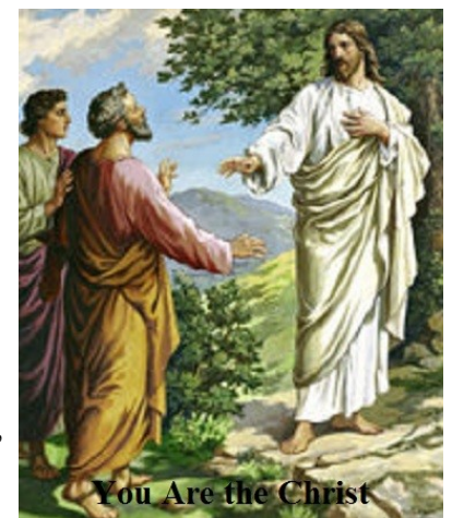
You Are the Christ